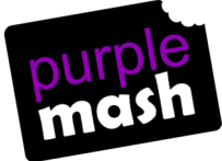
Set 1 Sounds

Login to apps at home to support your child's learning.