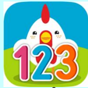
Cyfri Gyda Cyw