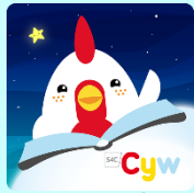
Amser Stori Cyw