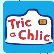
Tric a Chlic