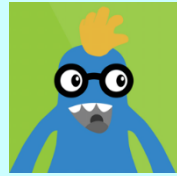
Bys a Bawd