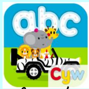
Cyw a'r Wyddor