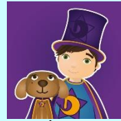
Dewin a Doti