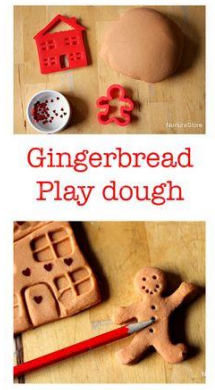
Gingerbread Play dough

Why not make some gingerbread dough and build a house?