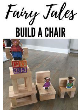
Fairy Tales BUILD A CHAIR

Play 'who am I?' One person thinks of a fairytale characters and others have to guess by asking questions